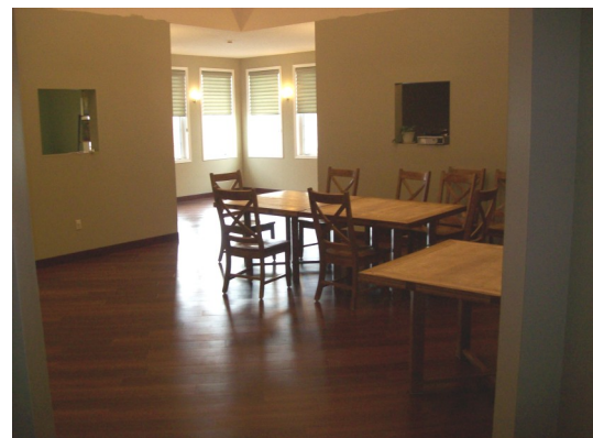
(CADA Shelter dining room area after new floors were installed.)