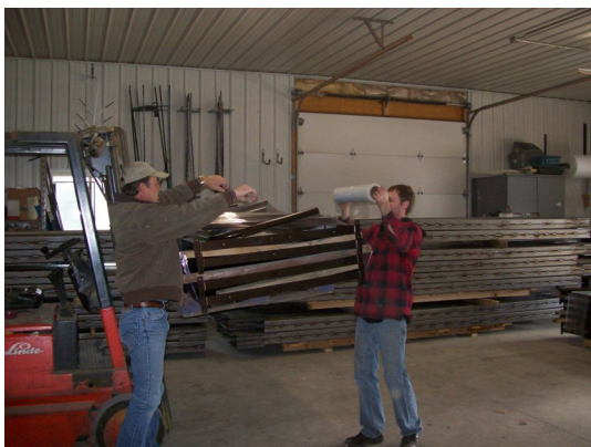
(Powder Werks wrapping up newly painted bed frames to be moved back to the CADA shelter.)